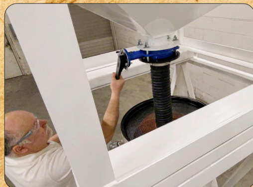
6) Butterfly valve is opened, loading abrasive into vessel.