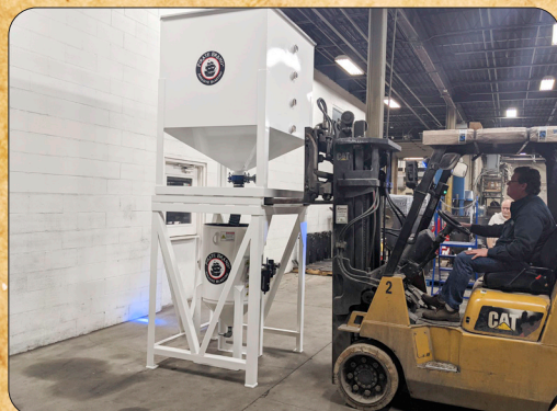
5) Hopper is placed back into base.